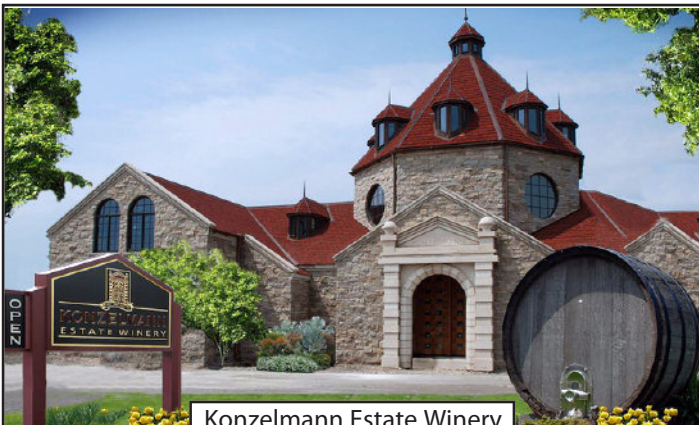
Konzelmann Estate Winery