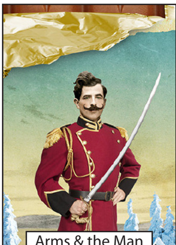
Arms & the Man

Day three begins with another included breakfast followed by free time to enjoy the area. After lunch on our own, we depart for home, stopping at Magnotta Winery for a wine tasting and shopping. Rest stops will be made for our comfort en route and dinner on our own as we return home early this evening. Thank you for traveling with Bianco Tours.